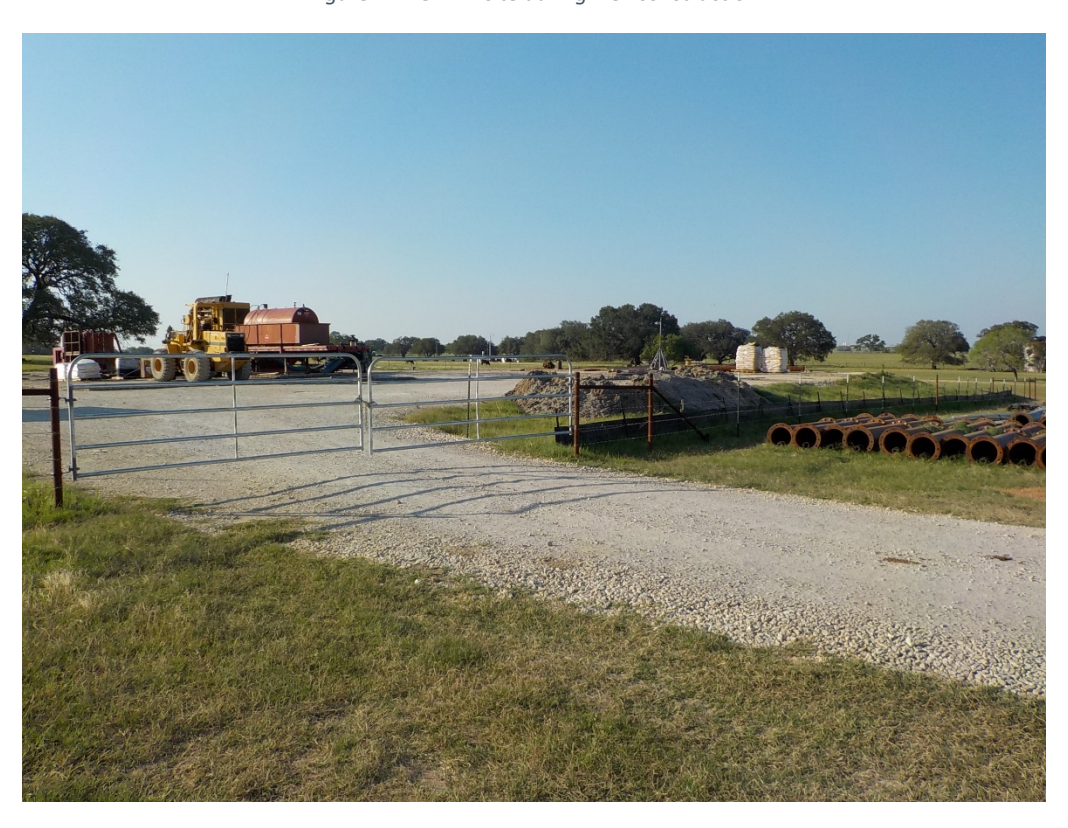
Figure 2: BGD-14 site entrance during well construction