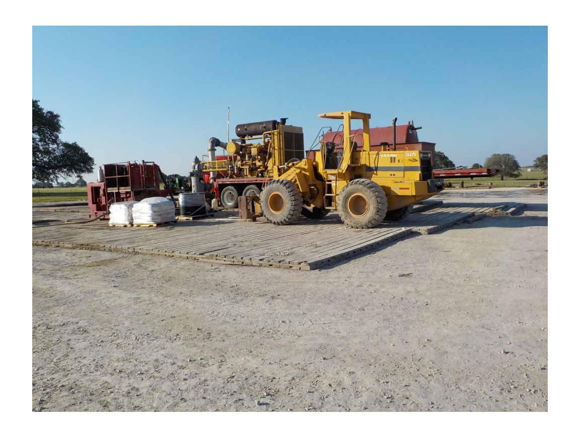
Figure 1: BGD-14 site during well construction