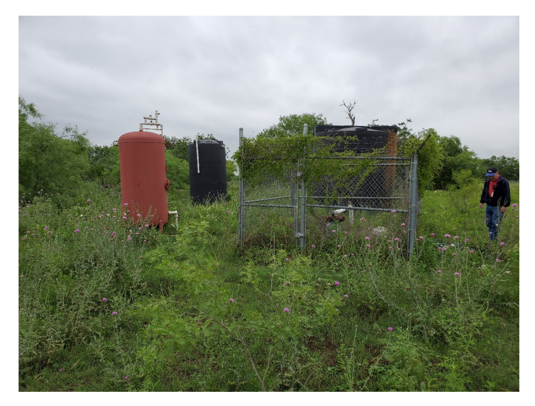
Figure 3: TW-1 Site